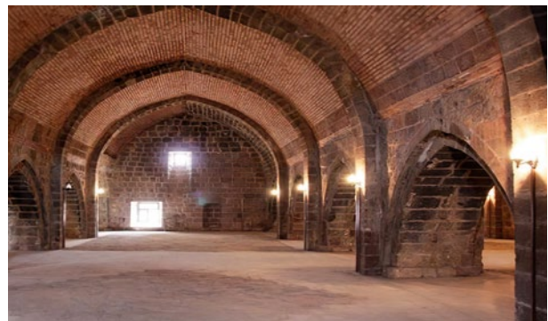
Fig. 4. Daylighting and artificial lighting of the El Aman Caravanserai

lighting of historical buildings are important. The products should be preferred in dimensions that do not affect the aesthetic integrity of the structure and the general appearance during the daylight, or the application points of the luminaires should be positioned so as not to affect the overall appearance [24].