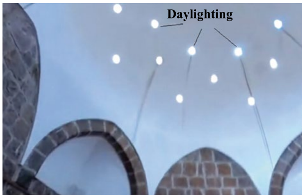
Fig. 3. Daylighting of the El Aman Caravanserai

*Note to Table 2 by the scientific editor: here and below, the characteristics of luminaires with traditional lamps such as incandescent, halogen, and metal halide lamps is used for the characteristics of the lamps themselves. When is specified power and lifetime of the luminaire, it is necessary to take into account the power and the lifetime also in relation to electronic components, such as ballast, ignitor and driver, as well as taking into account the optical system of the luminaire for determine luminous flux.