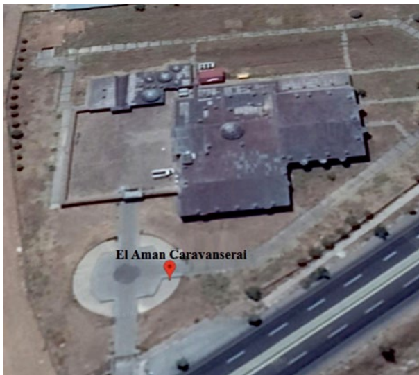
Fig. 1. View of the satellite of the El Aman Caravanserai

Integrated with advanced control systems, LED is one of the solutions for light quality and energy efficiency in the field of sustainable lighting. When designing illumination, one should take into account the historical value of the building, protection of historical buildings, the most appropriate combination between natural and artificial lighting, human visual welfare, perception and vision quality, visual ergonomics and satisfaction [11].