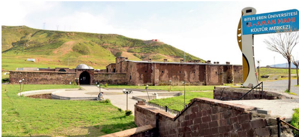
Fig. 2. General image of the El Aman Caravanserai

The light distribution characteristics and physical dimensions of the type of luminaire used in the