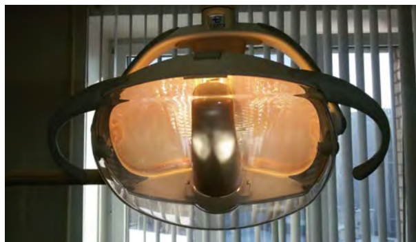
Fig. 3. Dental unit operating light