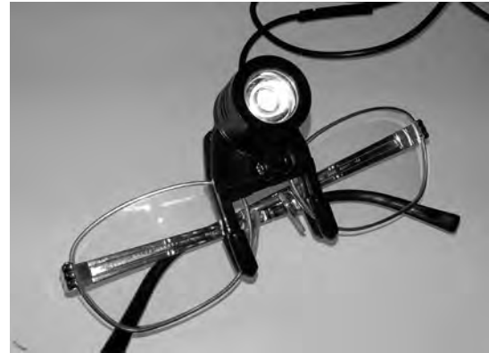
Fig. 4. LED headlight