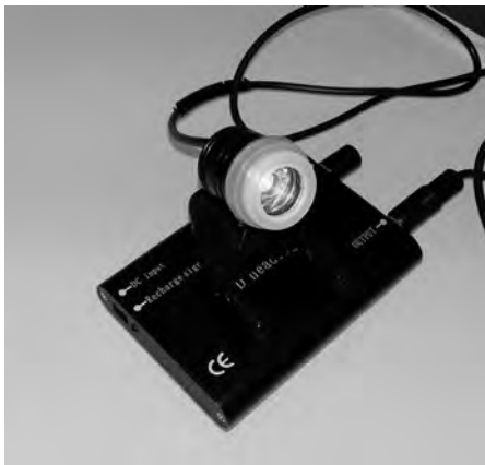
Fig. 5. Colour filter for LED headlights