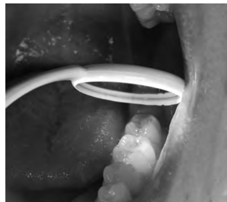
Fig. 7. LED dental mirror

The intraoral measurements were performed in upright and supine patient positions. The sensor was positioned at the upper incisors vestibular surfaces, lower molars occlusal surfaces and upper molars occlusal surfaces. In the each area 2 measurement series were performed under different light sources. Each series included 5 measurements. Totally it was performed 50 series of 5 measurements. Further illuminance average values and their standard deviations were calculated. Treatment zone illuminance values are presented in Table 1.