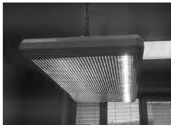
Fig. 2. Additional ceiling light

Treatment zone and operating field illuminance values can be significantly varied in dependence on dental operating light power and on additional light sources used. According to ISO 9680:2014 “Dentistry: Operating Lights”, dental lights must provide adjustable operating field illuminance close to range (8000–20000) lx [10]. In the RF Natio-