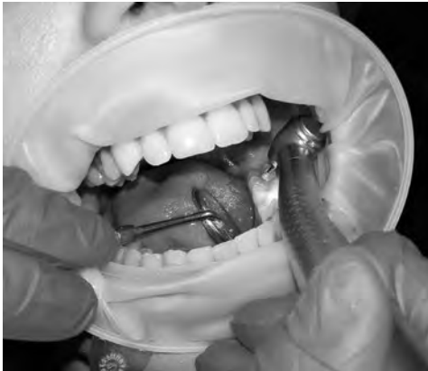
Fig. 8. Dental LED turbine handpiece