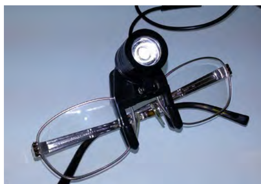
Fig. 4. LED headlight