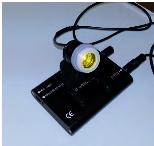
Fig. 5. Colour filter for LED headlights