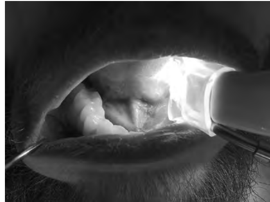
Fig. 9. Intraoral suction&lighting system MaxBite

Natural light is not enough for adequate illumination of dental treatment zone (232±20) lx, so it's not recommended to examine the patient under natural only. Though some authors recommend determining patients' teeth shade under natural light when direct or indirect esthetic restoration is planned. In that case it would be better to determine teeth colour near the window, where illumination is better (805±15 lx) and near the daylight.