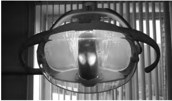
Fig. 3. Dental unit operating light