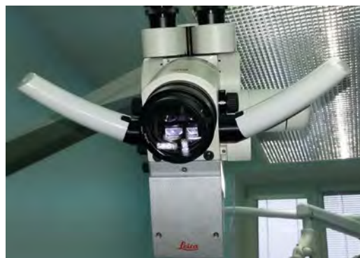
Fig. 6. Dental operating microscope