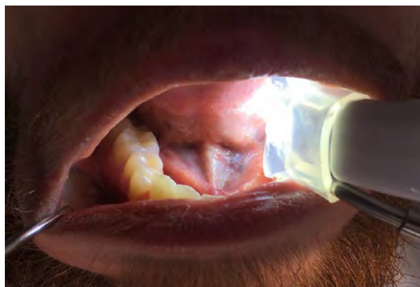
Fig. 9. Intraoral suction&lighting system MaxBite