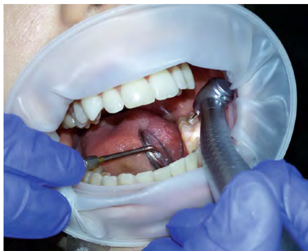
Fig. 8. Dental LED turbine handpiece