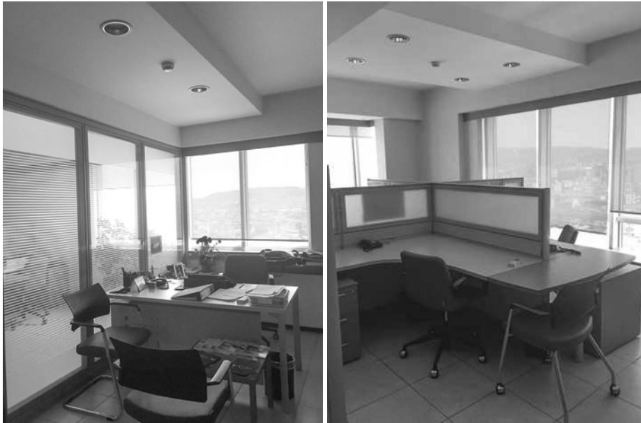
Fig.1. DENGİ open office and cell office spaces

In LEED2009, the light trespass criteria included both a horizontal and vertical foot-candle maximum, which varied by Lighting Zone, without a lot of specificity in how the criteria should be documented. In addition, the horizontal foot candle requirement was <0.1 fc (1.08 lx), which meant that if you had a high-density design with lighting anywhere near the LEED boundary, this credit was nearly impossible to attain even if your exterior lighting was very sensible and dark-sky friendly. In LEED V4, there is only a vertical foot-candle requirement, with clear guidance on how the calculation grids should be built, or you can comply by using fixtures with an appropriate bug rating [12].