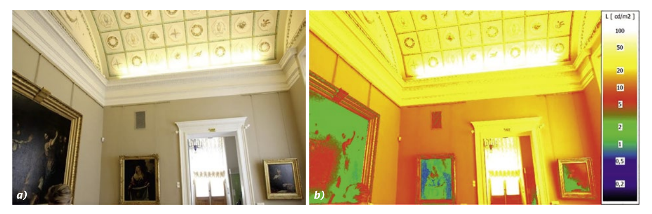
Fig. 1. General view of Hall No. 277 "Art of France of the 17th century" (a) and luminance distribution across the room (b)