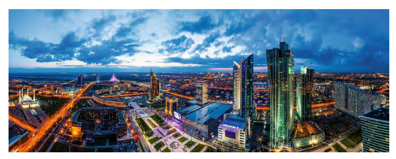
Fig. 2. Panorama of evening Astana.