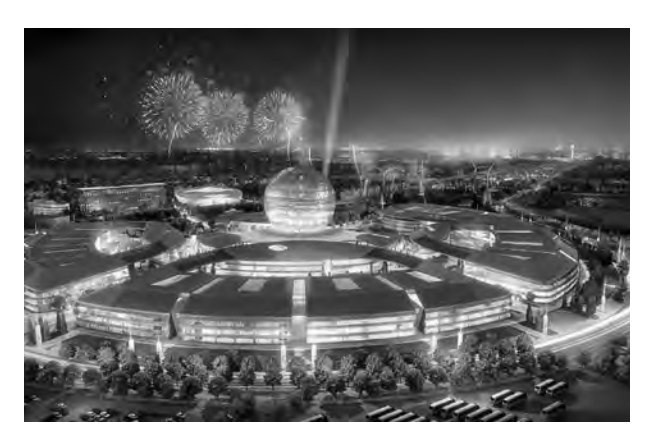
Fig. 7. Evening illumination of the Kazakhstan national pavilion of the international specialised EXPO-2017 exhibition.

Thus, an attractive luxury of the most various light decorations gives the city a festive art image and aesthetics, and sets a special psychological perception. It should be noticed that in Astana namely in 2002, light dynamics was applied for the first time on a snow and ice construction as a festive decoration or a light arrangement.