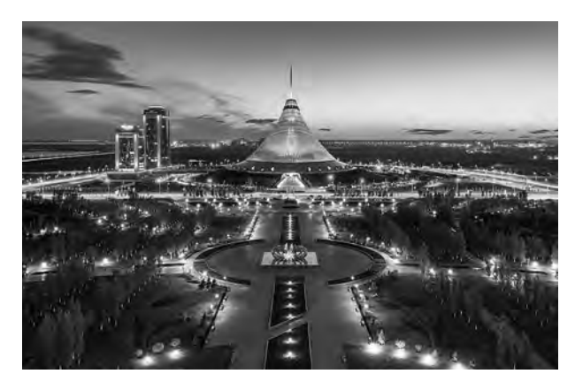
Fig. 5. An evening view of the Khan-shatyr shopping and entertaining centre.

centre is located to complete the general light panorama (architect Norman Foster). This ensemble has a unique light decoration creating an illusion of a certain unreality and lightness of a building-dome as though soaring in air and shining from within (Fig. 5).