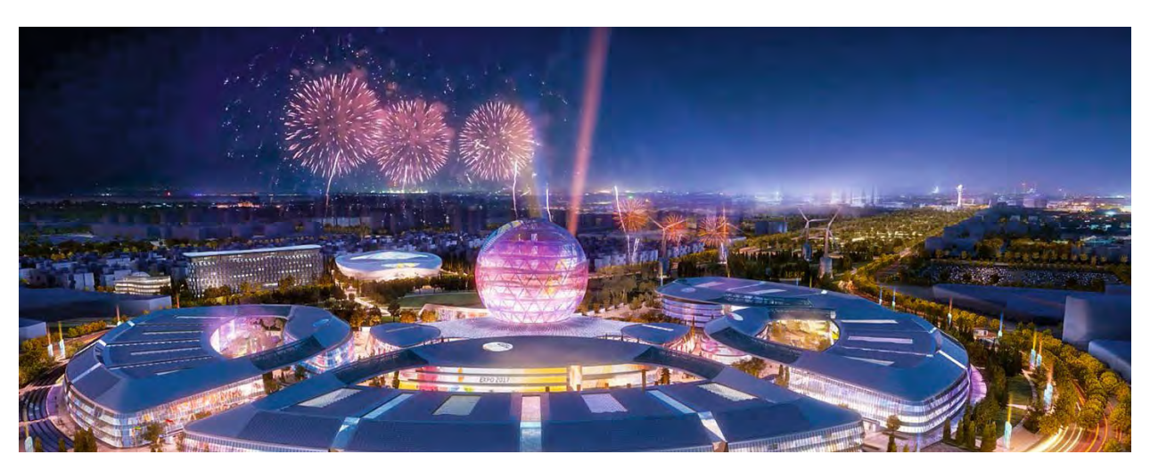
Fig. 7. Evening illumination of the Kazakhstan national pavilion of the international specialised EXPO-2017 exhibition.