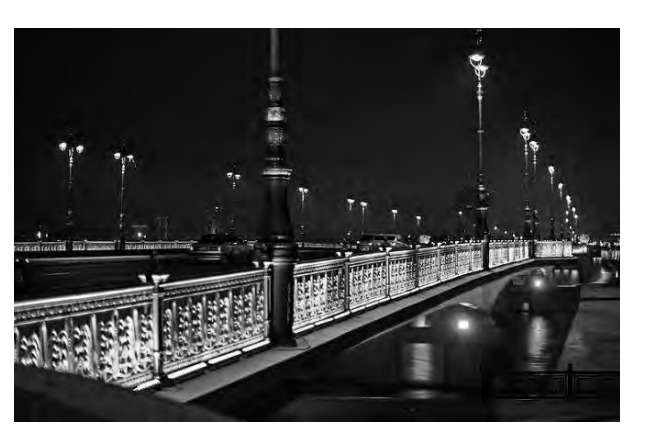
Fig. 6. Evening illumination of the Saryarka bridge.

Design of the luminaires, formation of the light pattern and light rhythm, as well as creation of lightand-colour optical fields determine art features of the comprehensive illumination of the new leftbank part of the city.