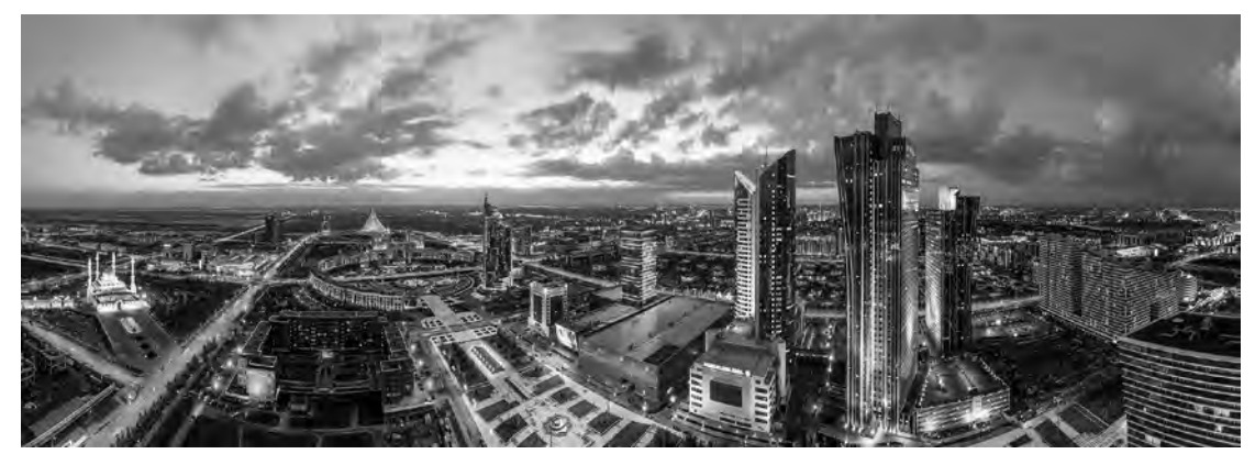
Fig. 2. Panorama of evening Astana.