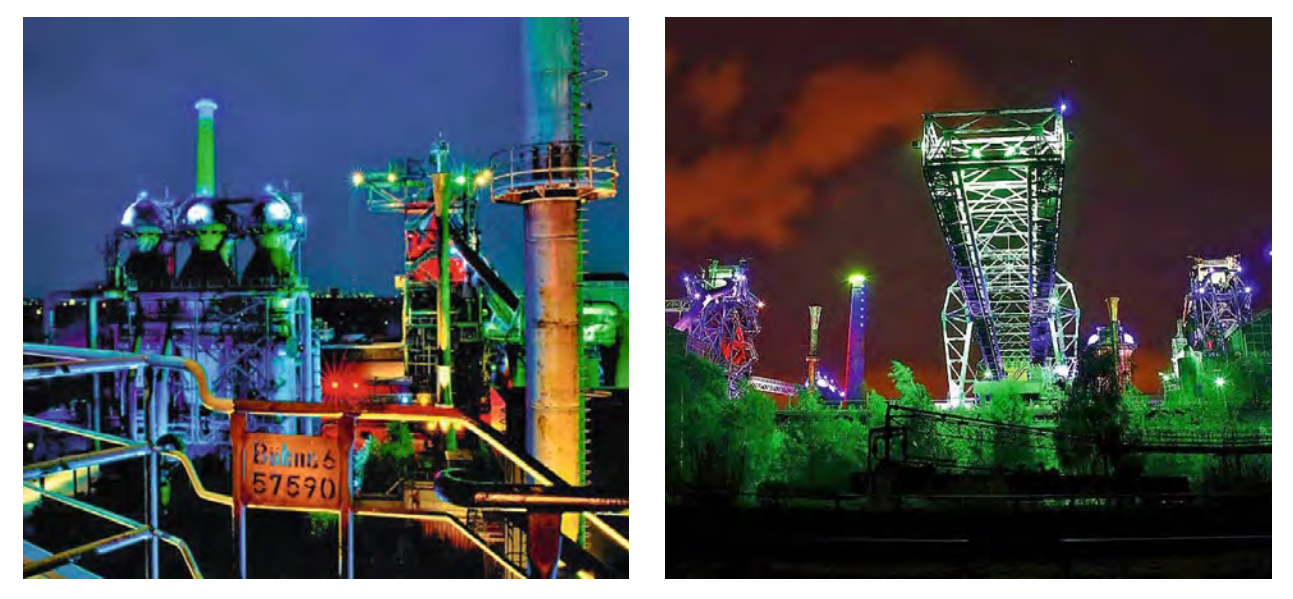
Fig. 16. Coloured lighting technology Park in a reopenedrevitalized steel mill in Duisburg

a – chemical plant in the Sinai desert, Israel; b – oil platform in the North sea; c – complex of the company "Promtekhelektro" in Kstov (Nizhny Novgorod region.)