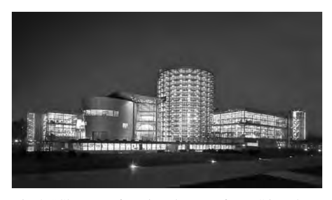
Fig. 3. "Glass manufacturing plantmanufactory" is a glowing factory of Volkswagen in Dresden

chological environment inside industrial facilities, which could improve individuals' productivity [1, 2]. The concept comprised a set of interconnected classic and new, architectural, organisational and technical interventions in the interior and on site of the facility. This included: creating breakout spaces for short breaks on the shop floor, where they could be exhibited; establishing visual connections with the outside world through glazed openings (and today with the help of video screens); adjusting the light level and light spectrum at the beginning and end of each shift within the ranges set by health and comfort standards. New ideas for the formation of an interactive environment could be introduced in the process of work. For example: the video camera focuses on a worker at certain time intervals and the image projects onto the screens in the shop. This stimulates a level of responsibility, changes in emotional state, awareness of one's role in the production process and self-affirmation in the labour force. Changing images to other workers, creates a sense of belonging to the team, a level of personal connection within the technological space without separation from the workplace. It is