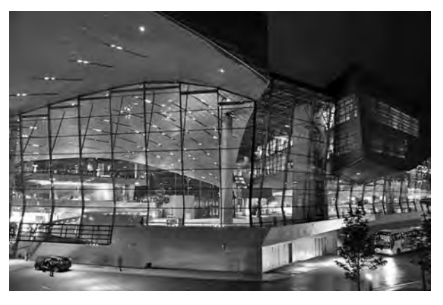
Fig.2 The glazed façade of the shop in Munich, BMW with a colour exteriorouter and interiorinner dynamic lighting in Munich