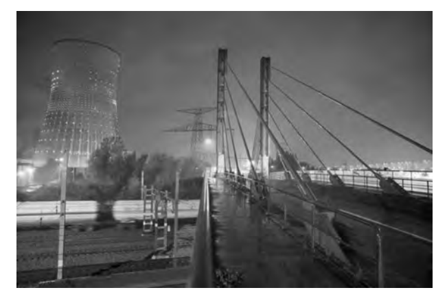
Fig.14. Lighting of the thermal power plant cooling tower in Brussels – one of the first media installation at the industrial facility

cal plants, gas tanks and water towers also large objects reflecting light in an urban context. Today, they rarely adorn the urban surroundings and industrial zones during the day, and are rather unpopular in artistic terms because of their unkept appearance, but at night they could become spectacular media screens. An example of this can be found in Brussels: an LED cord is mounted on a powerful hyperbolic-parabolic power plant cooling tower, running projections of a variety of colour animated images - flying birds, ornaments, text, etc. (Fig. 14). Our concept proposal from 2004 on the illumination of numerous cooling towers in Moscow [5] was not considered by the Moscow authorities but was implemented in Yekaterinburg and Samara (Fig. 15).