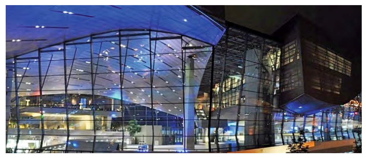
Fig.2 The glazed façade of the shop in Munich, BMW with a colour exteriorouter and interiorinner dynamic lighting in Munich

Lighting of Engineering Structures and Industrial Facilities: New Aspects of the Topic