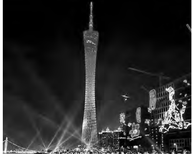
Fig. 13. Lighting of a TV tower in Guangzhou