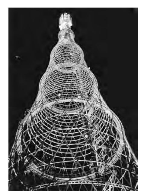
Fig. 10. Stationary two-colour floodlight lighting Shabolovskaya TV tower

added a diode mesh "stocking" onto the tower with a dynamically changing colour light pattern and temporarily preserved the unique ground system of aerial illumination made in the 1990s by Svetoservis (Fig. 9, c). The technically simple lighting of the elegant lattice of the Shukhov tower, flooded in 1997 by two-colour floodlight (Fig. 10), was often reconsidered in order to compete with the Eiffel tower in Paris; this was an initiative of Yuriy Lujkov, then Mayor of Moscow. However, all attempts to hang lighting equipment on the rusted structures of the tower were reasonably rejected by the Moscow office for the protection of monuments – we accounted for this and took it as given from the very beginning of the project [4].