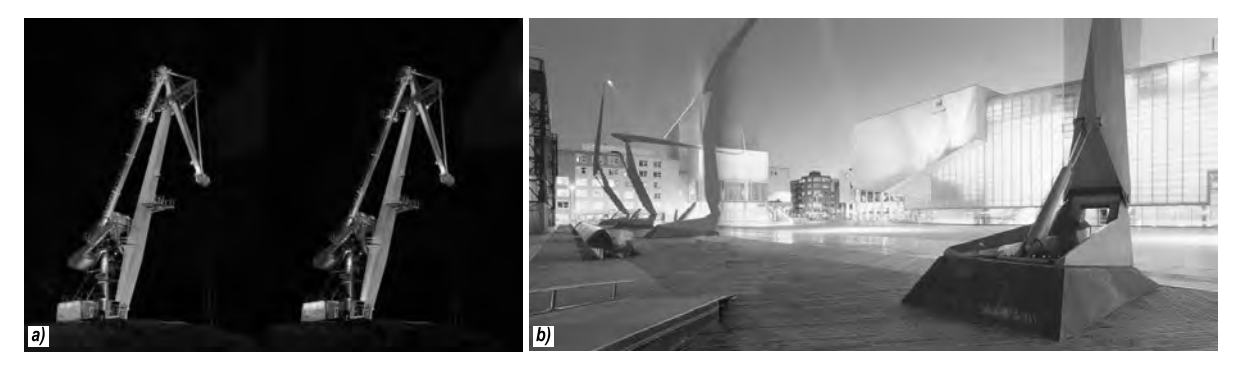
Fig. 8. Decorative lighting of port cranes as urban relics: a – imitation of cranes at the Theatre square in Rotterdam; b – port cranes in Murmansk, illuminated by colour light

region, in the endless tundra in the North of Russia, on oil platforms in the seas and Arctic ice (Fig. 7, b and c).