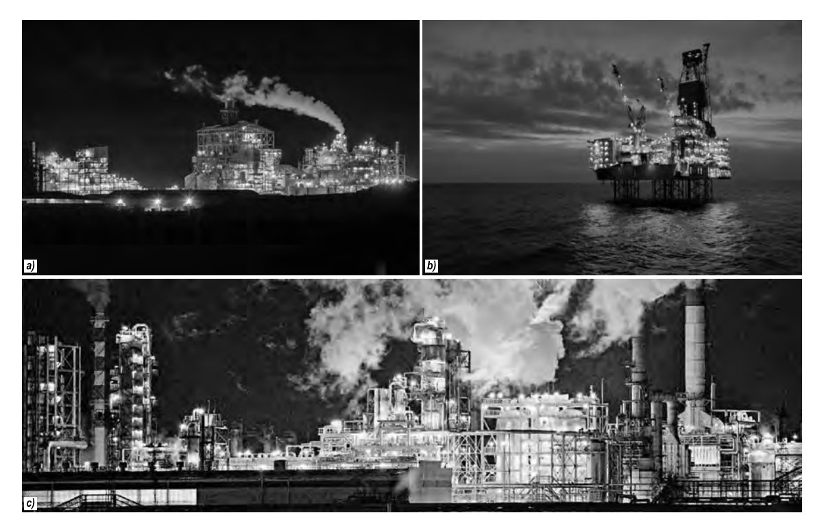
Fig. 7. Element of technological and signal lights in the night panoramic views of oil and gas, chemical and processing facilities:

reactor columns, cylindrical structures, stairs and bridges, winding pipelines. A competent system of electric lighting successfully reveals powerful architectonics, scale and energy of this 21<sup>st</sup> century (Fig. 7, (a). Even the basic mandatory technical and signal lighting of such plants make an impression on the unprepared observer. For example, driving in the evening towards Yaroslavl from the south reveals numerous electric lights and the live flames of the flared gas over the refinery stacks, which fascinate the eye. You can imagine even more powerful and sparkling complexes at night in the Tyumen