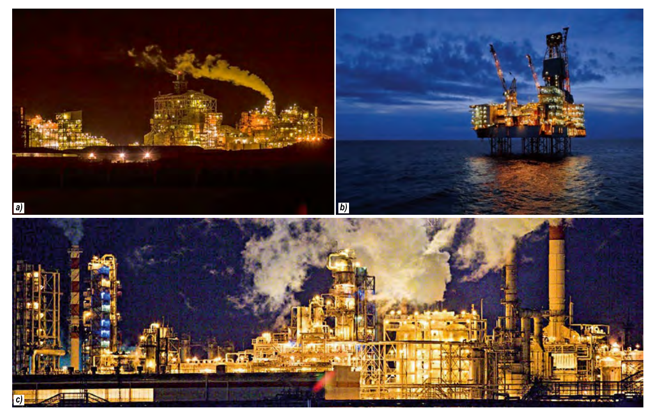
Fig. 7. Element of technicaltechnological and signal lights in the night panoramic views of oil and gas, chemical and processing facilities:

Nikolai I. Shchepetkov, George N. Cherkasov, and Vladimir A. Novikov Lighting of Engineering Structures and Industrial Facilities: New Aspects of the Topic