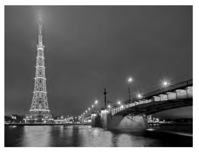
Fig. 11. Light-graphic version of TV tower illumination and coloured lighting of Kantemirovsky bridge in St. Petersburg

added a diode mesh "stocking" onto the tower with a dynamically changing colour light pattern and temporarily preserved the unique ground system of aerial illumination made in the 1990s by Svetoservis (Fig. 9, c). The technically simple lighting of the elegant lattice of the Shukhov tower, flooded in 1997 by two-colour floodlight (Fig. 10), was often reconsidered in order to compete with the Eiffel tower in Paris; this was an initiative of Yuriy Lujkov, then Mayor of Moscow. However, all attempts to hang lighting equipment on the rusted structures of the tower were reasonably rejected by the Moscow office for the protection of monuments – we accounted for this and took it as given from the very beginning of the project [4].