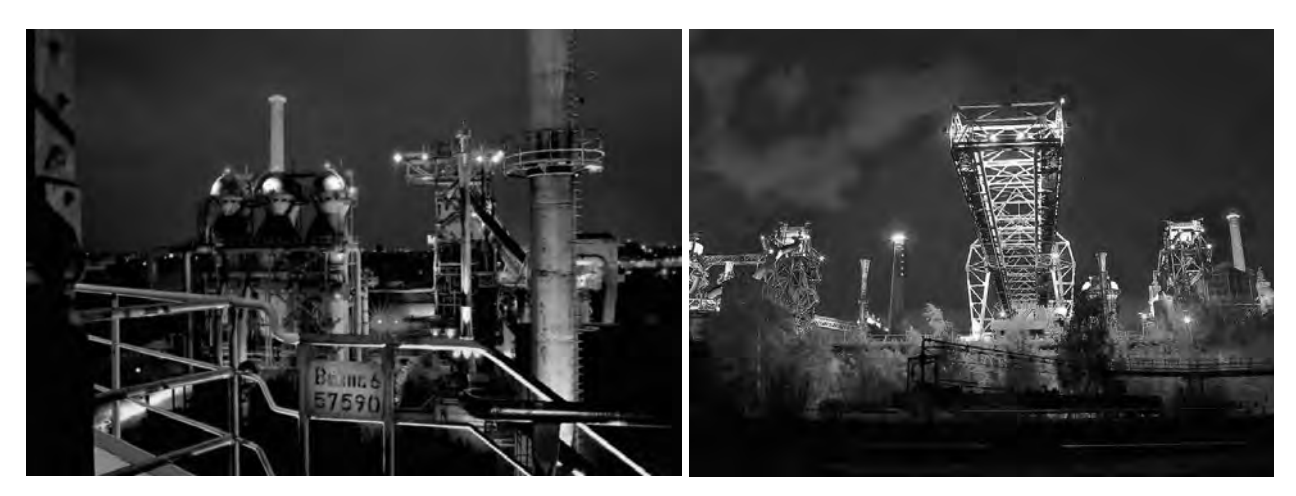
Fig. 16. Coloured lighting technology Park in a reopened steel mill in Duisburg

Even more difficult for an urban solution and further adaptation to modern life are examples of the preservation and conversion of large industrial facilities, for example, metal production plants. In the West of Germany in the industrial Ruhr, many steel plants from the 19<sup>th</sup> and 20<sup>th</sup> centuries were not destroyed after the Second World War, but turned into a kind of tourist centres. One of the symbolic, attractive, accessible and effective methods of