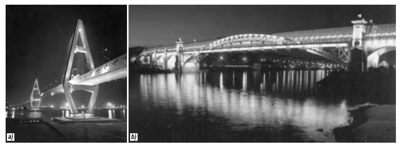
Fig. 4. Colour dynamic lighting of bridges: a – Meiko East Bridge in Nagoya; b – St. Andrew walking in Moscow

be applied as long as they do not interfere with the production process. The script and facilitation of such tours allows the visitor to become immersed in the atmosphere and space of production, making the industrial process a fascinating show, with the workplace as the central "hero".