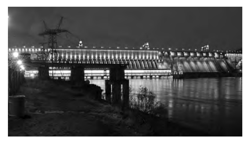
Fig. 6. Architectural illumination of Krasnoyarskaya hydroelectric power station

power stations (Fig. 6), oil refineries, sewage treatment, and gas processing plants, become the topic of evening tours. In other cases, they appear like fantastic mirages, decorating the night landscape as seen from buses, trains, personal transport. For example: a chemical plant near the Dead Sea in Israel, is seen from afar as a bright spot of light in the darkness of the desert. The impression is enhanced by dynamically lit steam columns from the stacks. It is impossible to identify as an industrial object from afar. As you approach, it turns into a clear group of light verticals of open process equipment,