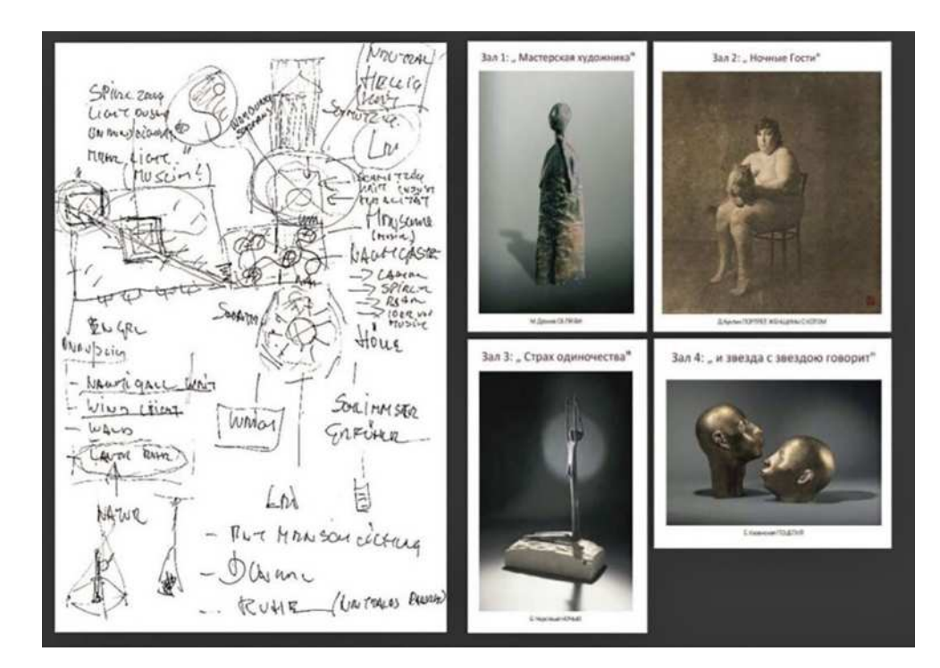
Fig. 1. Sketch on paper and description of the exhibition halls

In my opinion, the Artist's image is close to the lyrical hero of the poetry by I.A. Brodsky. Loneliness is both a source of inspiration and a great suf-