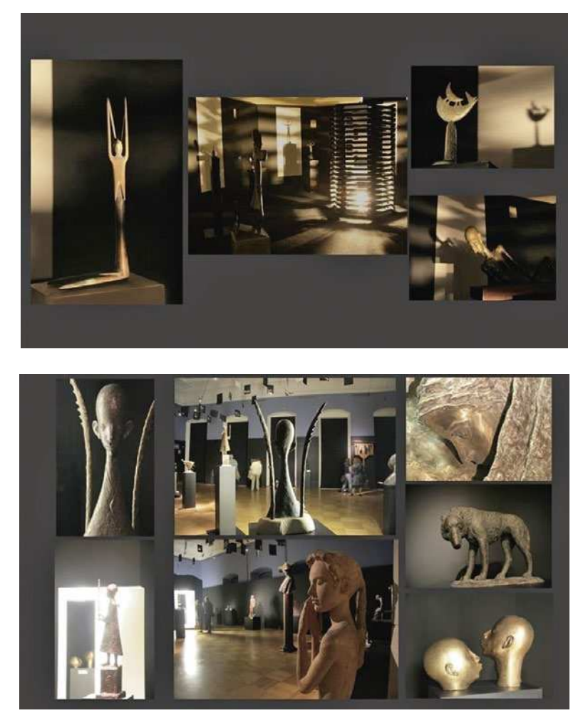
Fig. 4. Hall No. 3 "The Horror of Loneliness"