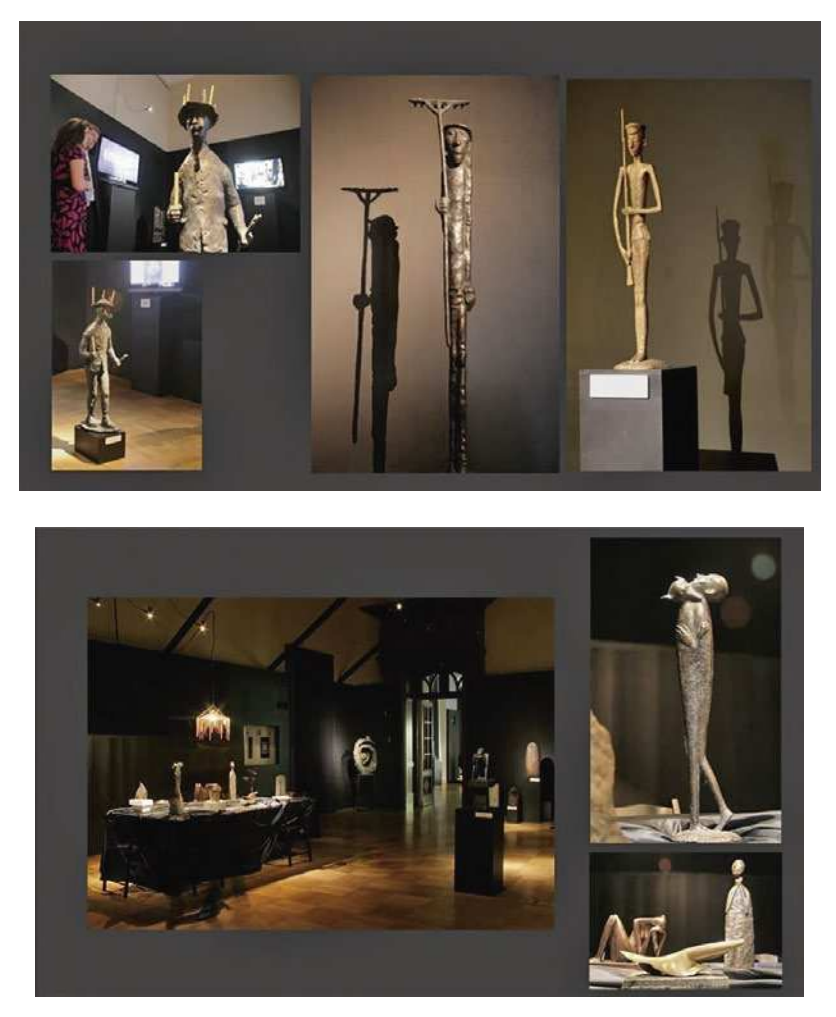
Fig. 2. Hall No.1 "The Artist's Studio"