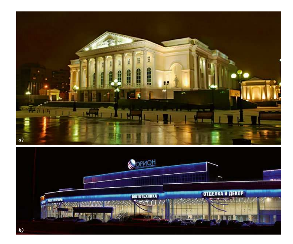
Fig. 7. "Classic" illumination of the Tyumen Drama Theatre ( a ) and modern colour illumination of the Orion shopping centre ( b )

sionality. Its optical structure is an intermittent and continuous system of areas with different scale, designation and hierarchic level modulated by light, with specific rhythm, discrete and heterogenic light engineering parameters in which, in turn, the hierarchic system of light ensembles and dominants, which dominates in the light composition of the city and is very important for it, should be distinctive. Light modulation is performed on the basis of conceptual light-and-colour zoning by selecting corresponding means and modes of illumination of the ground surface and objects forming the light environment in specific situational spaces and light architectural ensembles which are radically different from daytime ensembles in terms of visual characteristics.