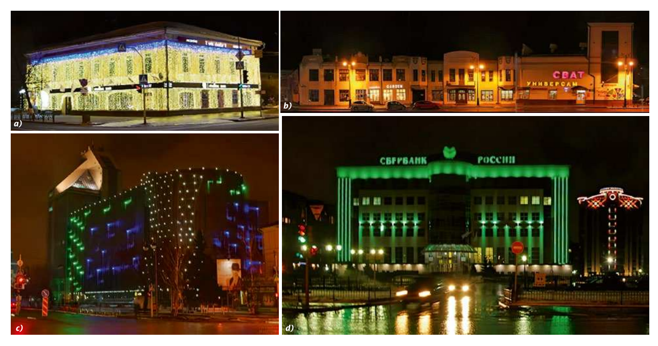
Fig. 4. House of G.T. Molodykh ( a ) and House of M.A. Bryukhanov ( b ) are the examples of stone buildings of the second half of the 19<sup>th</sup> century – early 20<sup>th</sup> century with commercial premises on the first floor (Pervomayskaya st.) illuminated by advertising lighting alien to the nature of historical architecture; Tyumen Infection Pathology Research Institute ( c ); Sberbank building in green light ( d )

ble bridge across the Tura river is well-perceived at a distance but not nearby where the glare effect caused by non-accurate installation and aiming of LD are obvious; varying chromaticity of the facade lighting of TyumGASU (building of TIU (Tyumen Industrial University) – ex-Kolokolnikov college) does not fully comply with the status of neoclassical building of early 20th century (Fig. 5). However, existing AL of a number of objects deserves appreciation, for instance: traditionally floodlighting white AL of Krestovozdvizhenskaya and Spasskaya churches (Fig. 6); combined light AL of the Drama Theatre (Fig. 7, a) and colour lighting of Orion shopping centre (Fig. 7, b). However, unfortunately, the main historical and architectural dominants of the central part of the city, the Svyato-Troitsky monastery and Voznesensko-Georgievskaya church, are still not illuminated.