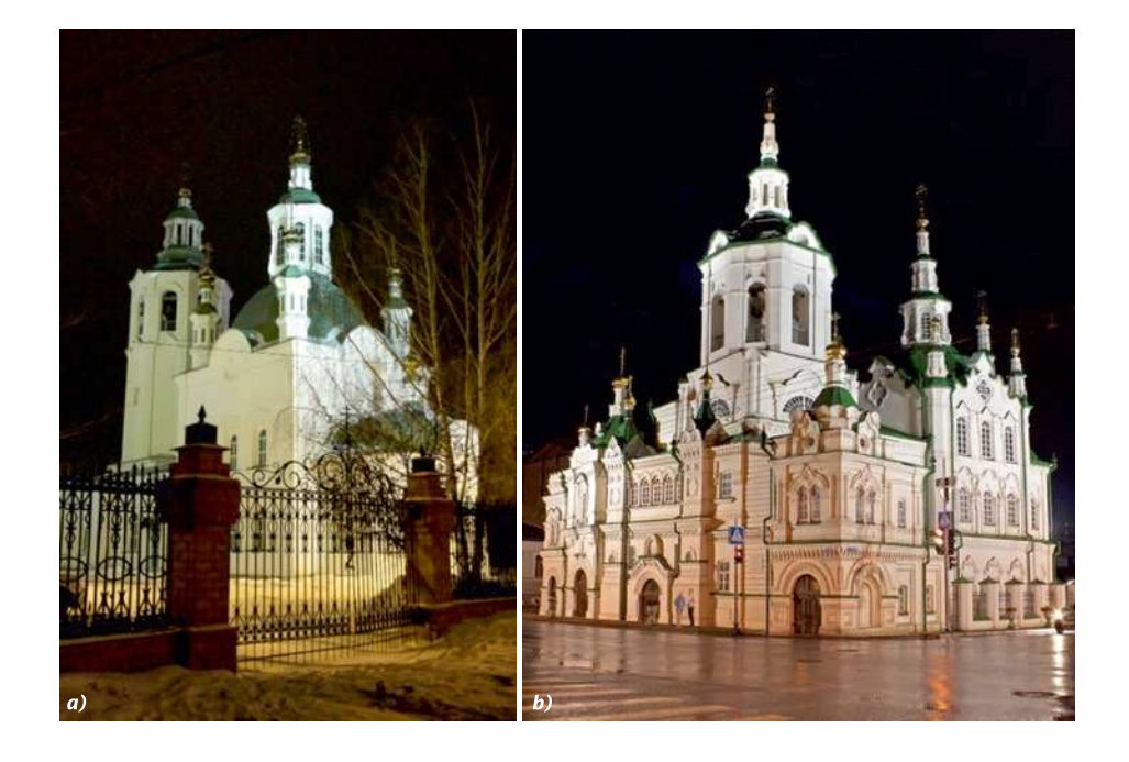
Fig. 6. Floodlight illumination of architectural monuments of the 18<sup>th</sup> century: Krestovozdvizhenskaya ( a ) and Spasskaya ( b ) churches

For solving of the problem of light and spatial arrangement of the urban environment, all three groups of LIs are forecast: utility, architectural and informational lighting. Special attention is paid to lighting of pedestrian areas [5]. Due to lighting of the ground and facades of objects forming it, the light environment of the city obtains three-dimen-