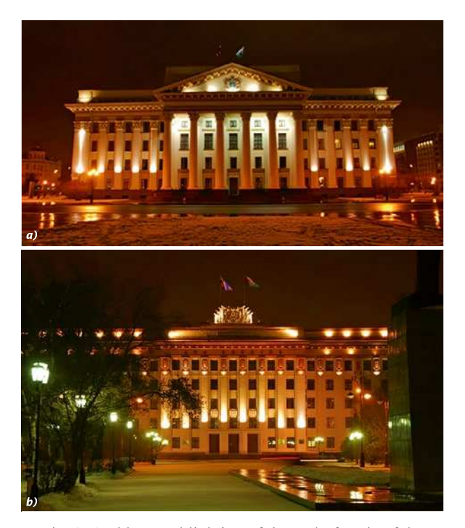
Fig. 3. Architectural lighting of the main facade of the building of the Tyumen region government at Lenin square (a) and the building of Tyumen regional Duma (b)

sian cities and towns including Moscow do not allow us to say that there are harmonious urban light ensembles formed in Tyumen which are of significance for the city and the region. For example: colour and dynamic lighting of the pedestrian ca-