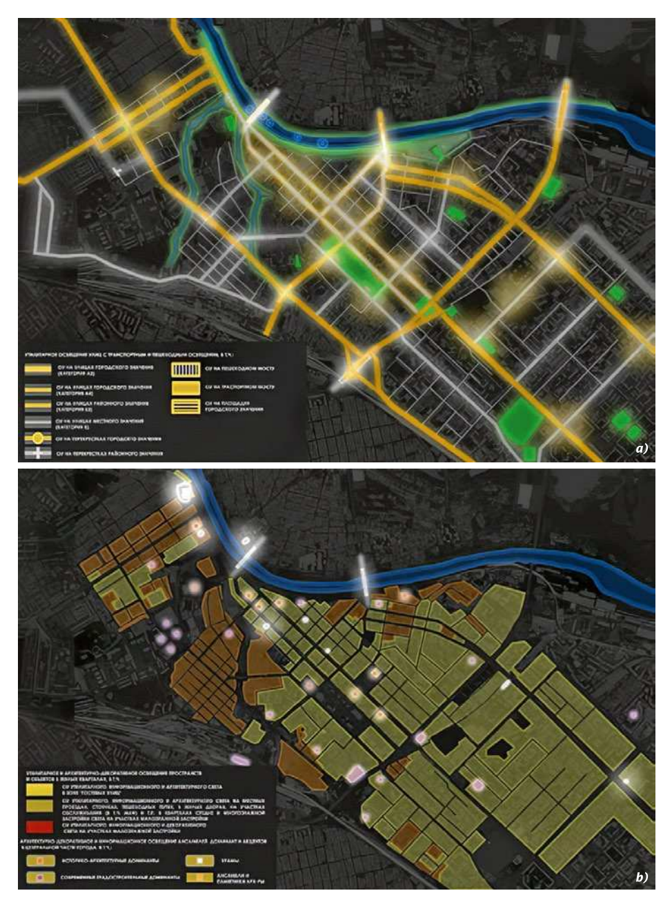
Fig. 8. General Plan of illumination of the central part of Tyumen: a is the the urbanised and natural "light structures"; b is the "light fabric" and the system of lighting dominants

and scale of LIs. These parameters are presented in the legend and explanatory note to the general plan of illumination.