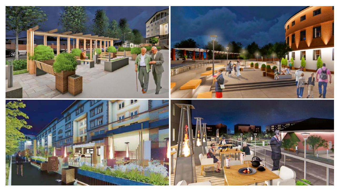
Fig. 9. Computer visualisations of the fragments of night-time light environment in sketch projects of Lenin st. improvement

important in residential areas during long autumn and winter evenings in Siberian climate. The important social task of yard spaces and recreational environment, and, in the first place, of outdoor illumination is to make residents (children with parents, grand-fathers and grand-mothers) to go out to communicate and have some rest after a working day. To solve these tasks, not only the utility lighting installations dominating in urban illumination (in terms of the number of lighting points, power consumption, etc.) should be used but also other groups of architectural and informational lighting.