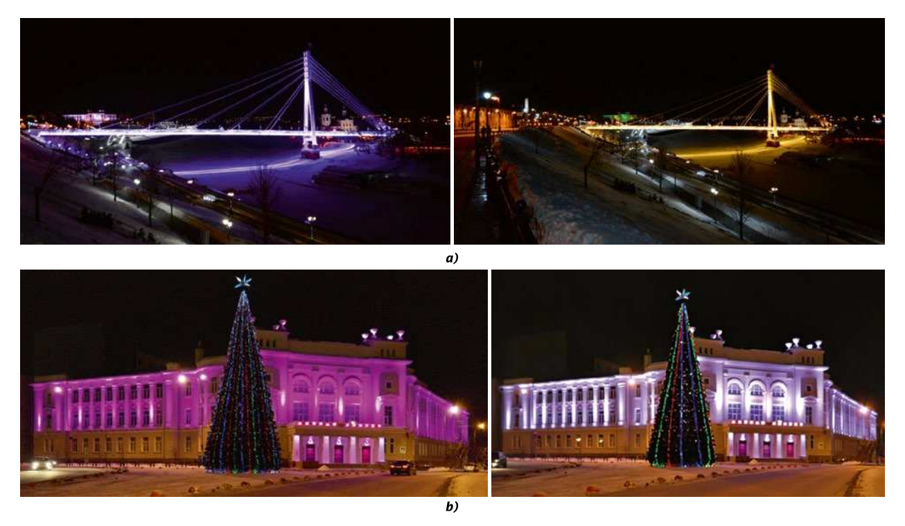
Fig. 5. Dynamic colour lighting of the Bridge of Lovers (a) and the historical building of TyumGASU TIU (b)

and illuminance of road surface, semi-cylindrical illuminance in some pedestrian areas) and their distribution are regulated by standards, selection of chromaticity of illumination in different areas is an issue of concern due to introduction of LED-based LDs and expected end of operation of HPSL in the city, which, to some extent, leads to loss of one of the tools of light-and-colour zoning of urban space. The concept specifies stage-by-stage replacement of yellow light of HPSL-based LDs in outdoor illumi-